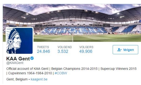
De Football club KAA Gent uses the slogan "Come On Blue-White" and on Twitter COBW

Recent research shows that in the past year more # trademarks have been filed. Most of them in the US. The hashtag itself does not make a trademark distinctive, so a combination with a descriptive element will not be sufficient to pass the absolute grounds test. For this reason, probably a lot of social media campaigns are not registered as a trademark.