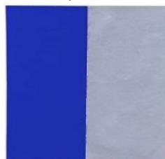
cancelled colour mark

Colours can be trademarks. For many, the colour combination of blue and silver, is sufficient to recognize the Red Bull energy drink. In order to protect this colour combination, Red Bull has filed two trademarks, consisting of a divided surface with the two colours, accompanied with a description.