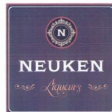
Benelux trademark registration

Everybody knows that the Benelux trademark authorities are very liberal as it comes to accepting trademarks. By law, they can refuse trademarks that are contrary to the public order or immoral, but this almost never happens. This seems convenient, but remember that these trademarks may be refused abroad. In Switzerland trademarks are easily refused on religious grounds and the EUIPO refuses trademarks containing the word F*CK. However problems can arise in the Netherlands as well, due to stricter rules regarding advertising.